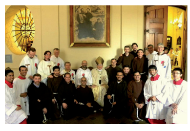
25 Años de presencia Capuchina en el Paraguay