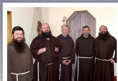
...and in Iceland