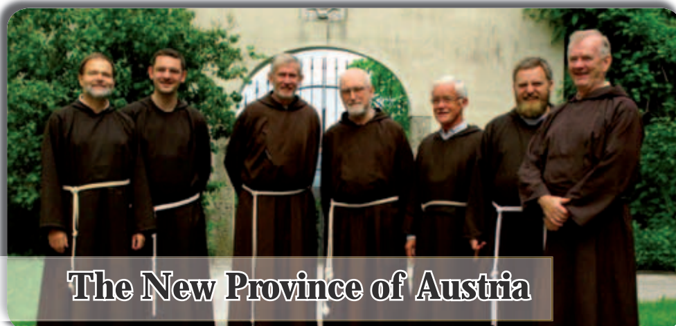
The New Province of Austria

Curia Generale OFMConv Via Piemonte, 70 00187 Roma · Italia Tel. 0039.06.4620121 Fax 0039.06.4828267 E-mail: bici@ofmconv.org