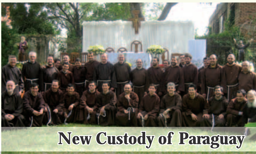
New Custody of Paraguay