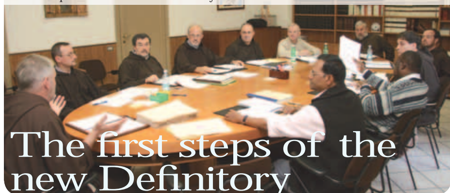
The first steps of the new Definitory

Curia Generale OFMCap Via Piemonte, 70 00187 Roma - Italia Tel. 0039.06.4620121 Fax 0039.06.4828267 E-mail: bici@ofmcap.org