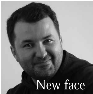
New face in the Curia